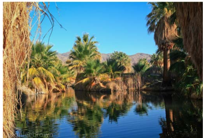
Dos Palmas Oasis.

Prehistorically the area was occupied by the Desert Cahuilla people who were dependent on Lake Cahuilla for many of its resources. This lake was fed by the Colorado River and experienced six inflows between AD 850 and about AD 1650. Habitation areas have been identified along various ancient shorelines. After the lake last dried up in about 1710, the Coachella Valley stayed dry until 1905 when a breach in a Colorado River levee created the current Salton Sea.