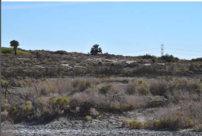
Green Hill site (CA-RIV-12608/H).