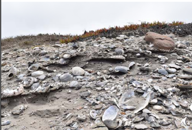
San Nicolas Island.