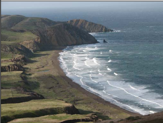
Santa Cruz Island.