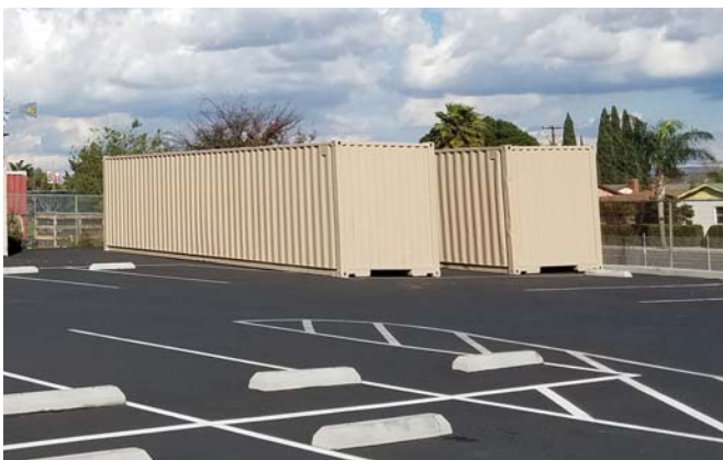
Containers holding PCAS collections.

PCAS members will continue to organize and re-bag collections. The vast majority of the collections are from Orange County sites, many of which have not been studied or reported on. Our goal is to make these collections available for study.