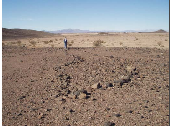
Rock alignment near Troy Dry Lake.