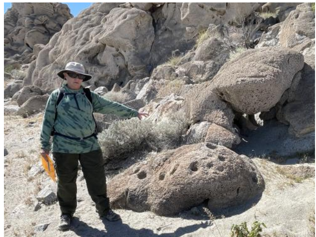
Field trip to the Coral Mountain site.