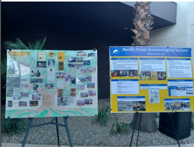
PCAS posters displayed at a poster session.

A Sunday field trip was to the Coral Mountain site (CA-RIV-15). Author’s note: I had been there years ago and honestly could not see anything beyond modern graffiti and trash. The site has been greatly cleaned up—many thanks to those involved. Having guides pointing out the many difficult to see prehistoric and historic features made for a unique and interesting trip.