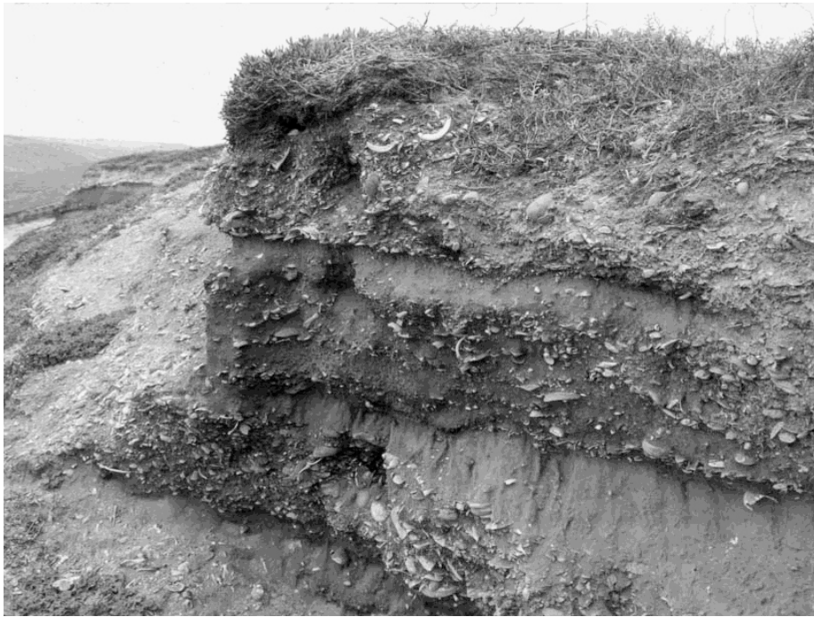
Fig. 2. Dense stratified shell midden exposure on San Miguel Island.

Channel Islands currently contain one of the earliest, most extensive, and best preserved archaeological records of maritime peoples in the Americas.