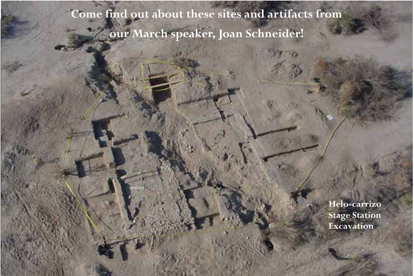
Helo-carrizo Stage Station Excavation