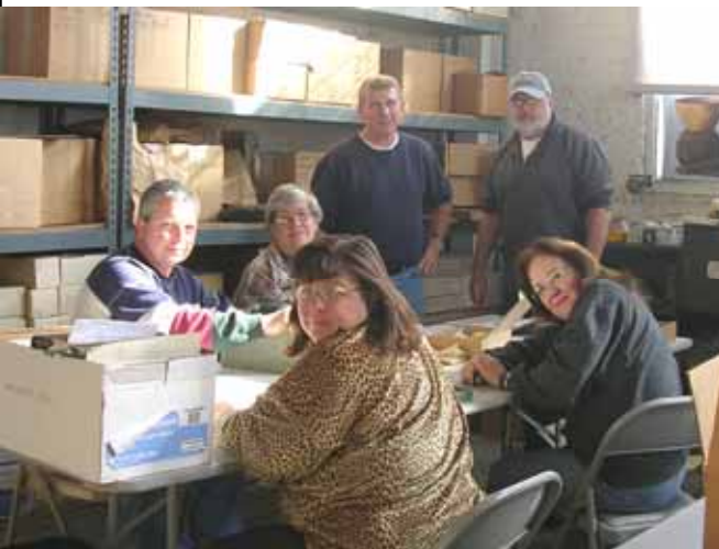
PCAS members at the February Curation Workday