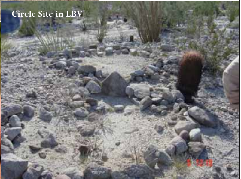
Circle Site in LBV