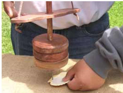
Drilling shells for jewelry.