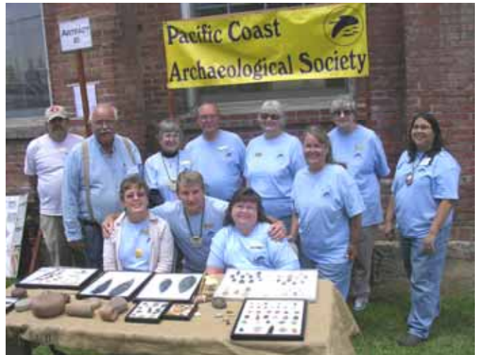
Archaeology Day volunteers.

PCAS undertakes outreach events to promote the