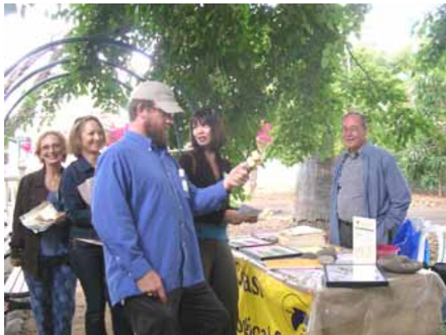
Playing the a ring and pin game with elk astragalus bones at a Day at the Ranch.

game (see photo below), which was certainly enjoyed by visitors to our table.