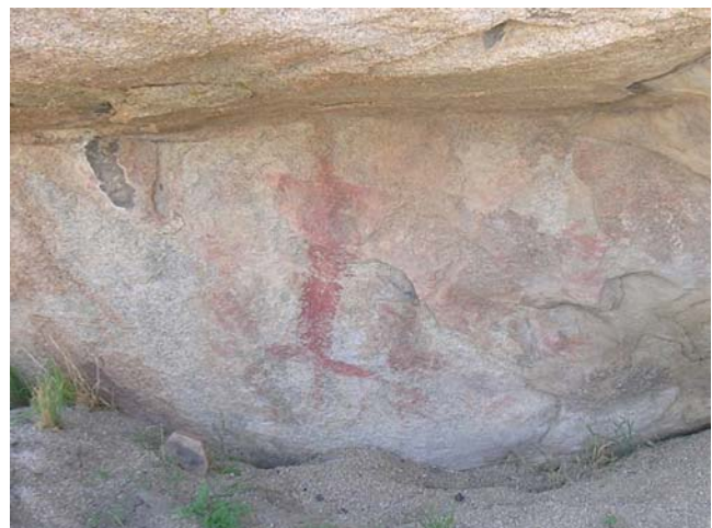
Red pictograph located north of Yucca Valley.