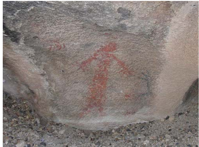
Red Lady pictograph at the Joshua Tree National Park equinox site.